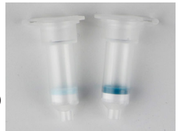
gDNA Removal Column RNA Purification Column